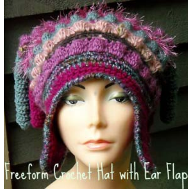
Freeform Crochet Hat with Ear Flaps