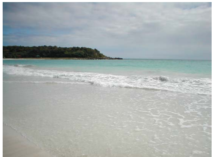
Care for a dip?