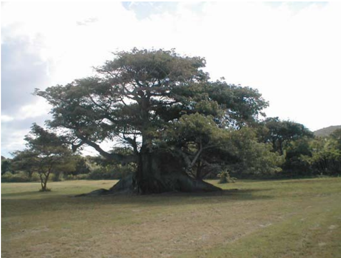
Wouldn't this look great in a pot?