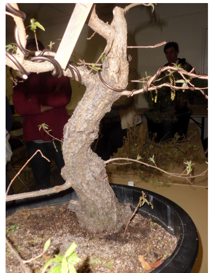
The finished product – for now.

In other news, the Branch Brook Park Bloomfest scheduled for April 22 was cancelled due to inclement weather. In the mean time, Cablevision has contacted us for a television feature on the GSBS and what we do, to be taped on June 12th – should be fun!