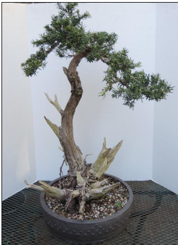
Yew thinned and re-wired.

Here are a couple of snapshots of what I've been tending to recently.