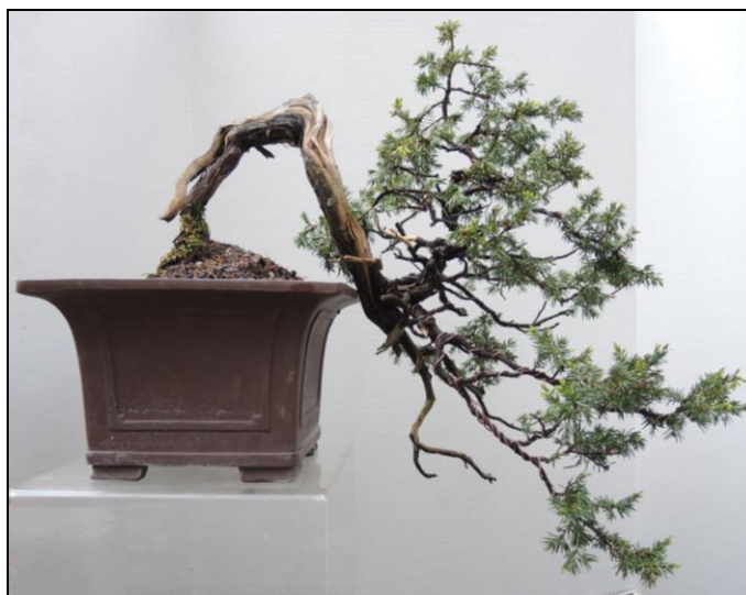
Juniper restyled and repotted.