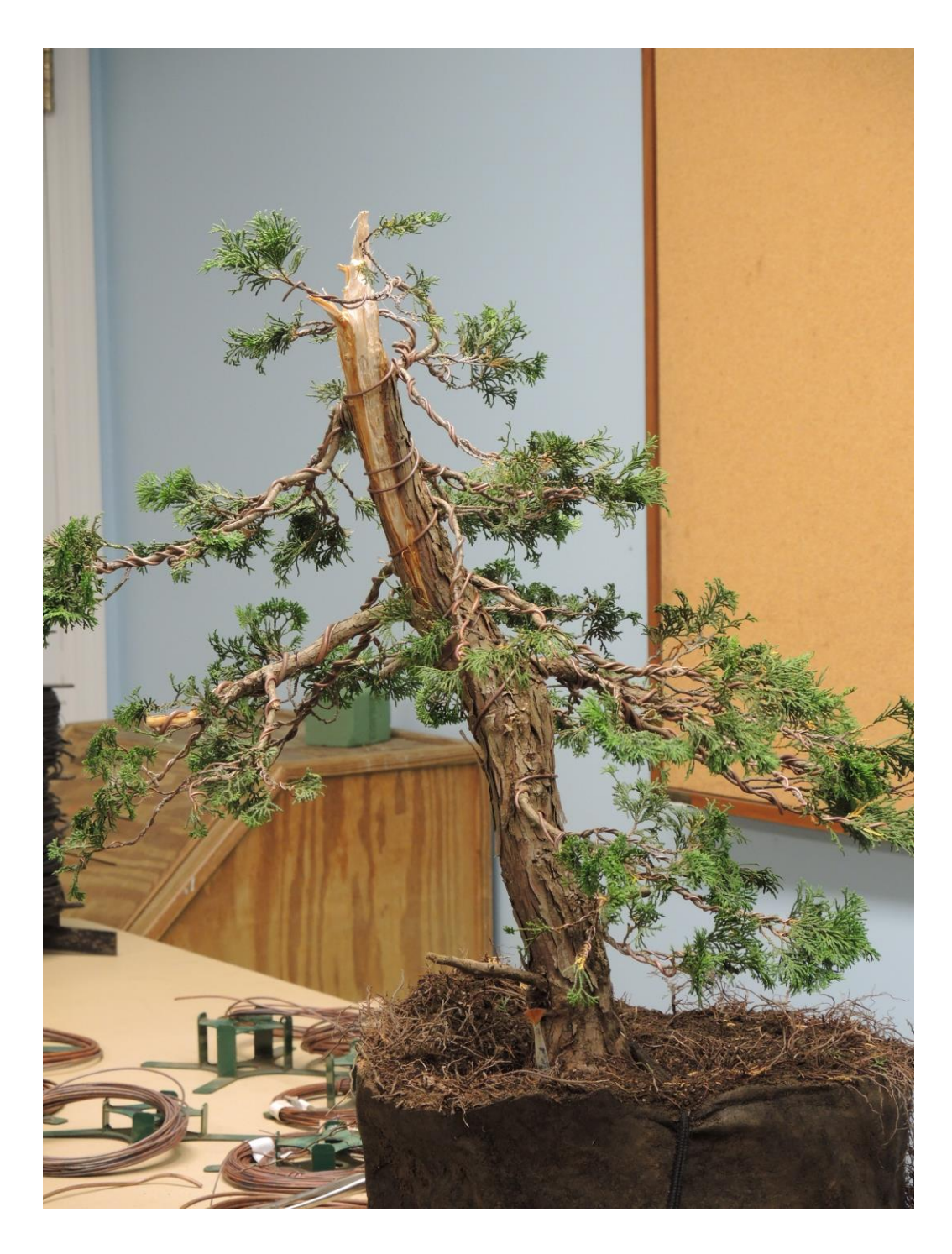
The finished initial design. The caretaker of the tree will leave the wires in place for a year or two, with the expectation of repotting this coming spring to slightly reduce the root ball and introduce some well-draining potting mix.