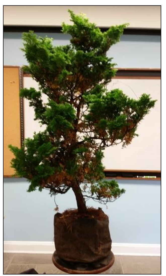
Left, the original Hinoki Cypress. Clockwise, removing the top of the tree to create a stronger trunk diameter/height ratio.