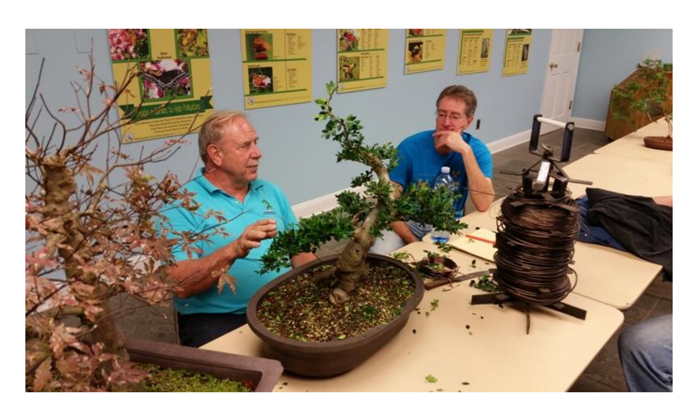
More workshop photos.