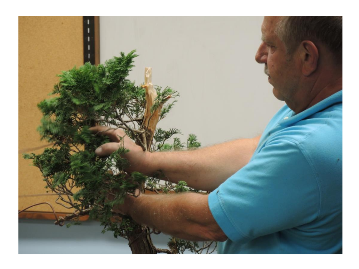
Branches not necessary to the design of the tree are removed, and the remaining branches are wired for initial placement.