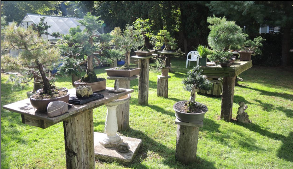
A view across Rick's bonsai garden.