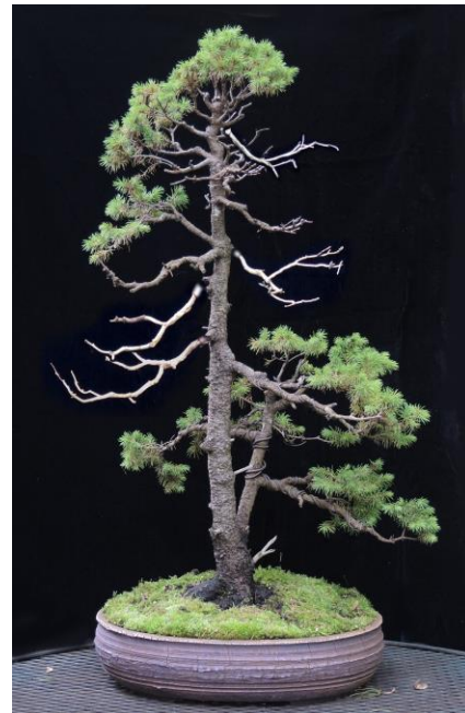
Left: a dwarf Alberta spruce in its current condition.