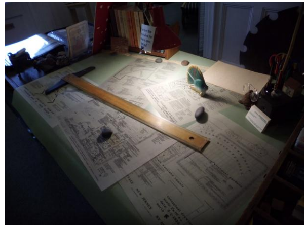
Greentree's work desk.

Details from a few of Greentree's landscape designs.