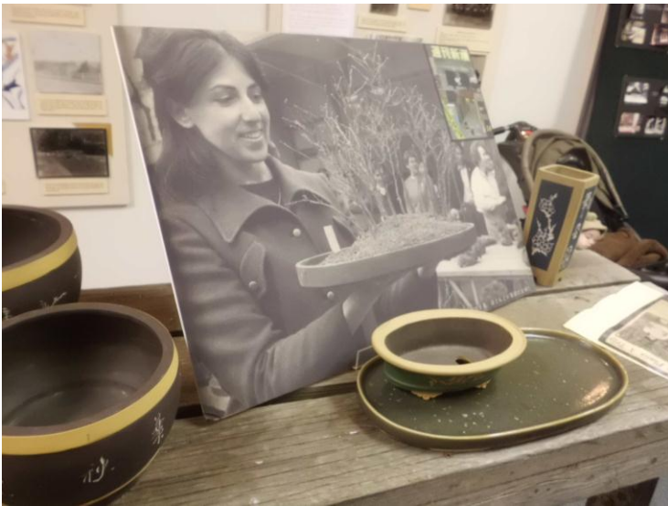
A portrait of Greentree taken in the 1960s.

Here are some of the images that I took away from my visit.