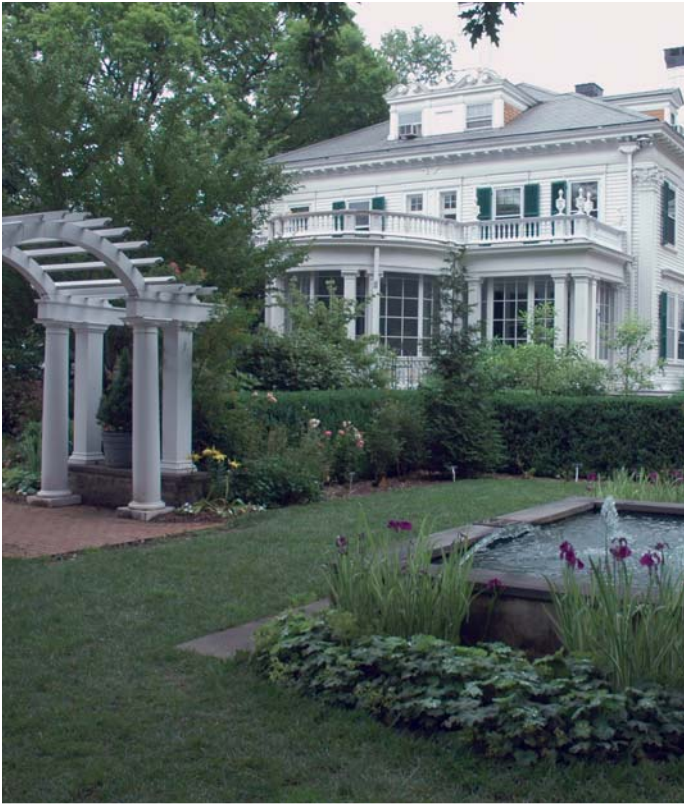
A popular spot for wedding photographs at the arboretum.