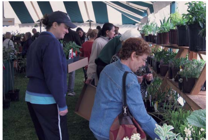
Happy shoppers at the 2008 Plant Sale.