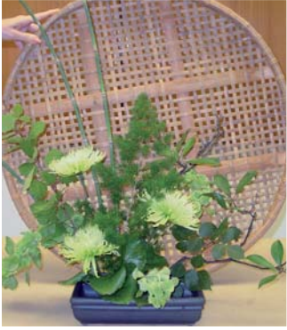
Ikebana flower arrangement.

This past year has seen over thirteen thousand people take advantage of the many lectures, cooking demonstrations, garden walks, cell phone tours, workshops and the annual Gingerbread Wonderland and Plant Sale in the Tent.