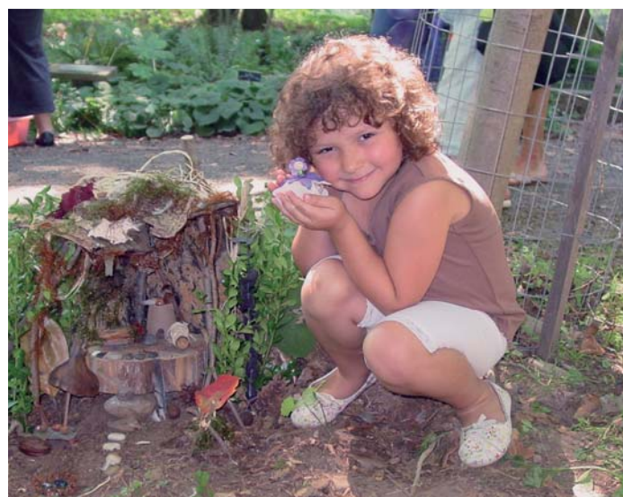
Fairy Day participant readies new home for garden fairies.

Various scout groups come for after school activities. This spring, five troops involving 71 children came for workshops to earn their badges.