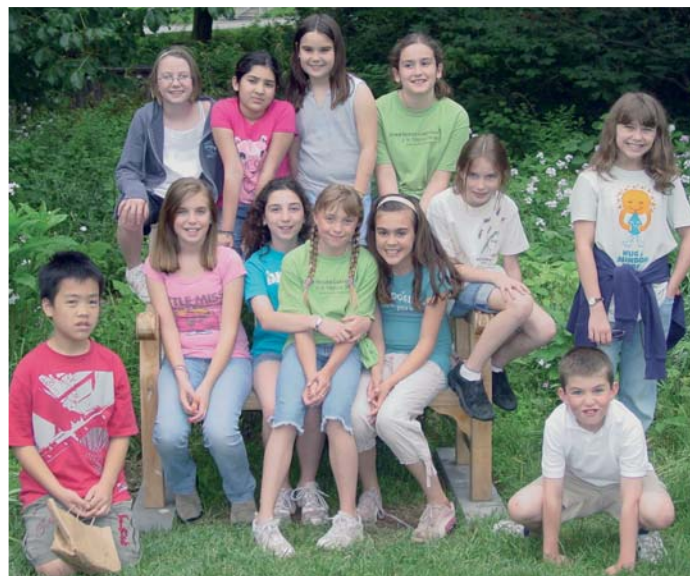
Junior Master Gardeners