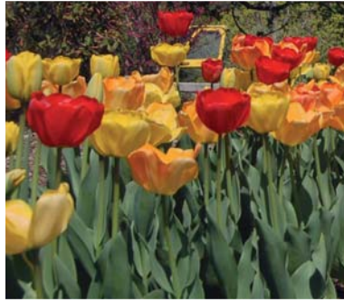
Spring tulip display.