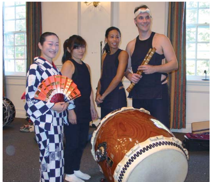
Taiko drums at “Focus on Japan”.

Wednesday March 4, 2009 was our day to enjoy the Philadelphia Flower Show. The displays interpreted the various areas of BELLA ITALIA. From the Lake Region in the North, through Venice, Tuscany, Milan, Florence, Rome, the Italian Riviera, and the sunny retreats in the South, all were represented in imaginative floral displays.