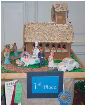
A Gingerbread Wonderland First Place winner.

As always the Gingerbread Wonderland attracted families, school groups, senior citizen groups and Gingerbread devotees. Over 10,800 people attended this “visions of sugar-plums” event.