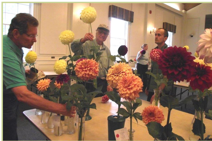
2014 Dahlia Show

In the coming year, the committee plans to find new ways to reach out and expand member numbers, while continuing to delineate and improve the many benefits of Friends' membership.