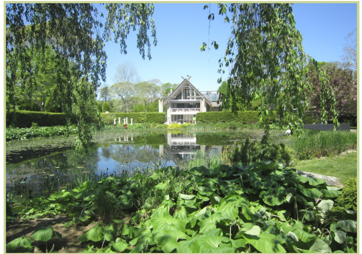
Peter's Pond / LongHouse Reserve

That disappointment behind us, we are currently looking forward to a fantastic overnight trip on June 2-3 planned in conjunction with Dig-it Magazine to four wonderful gardens on Long Island; the Nassau County Museum of Art, Planting Fields Arboretum, LongHouse Reserve and Madoo Conservancy.