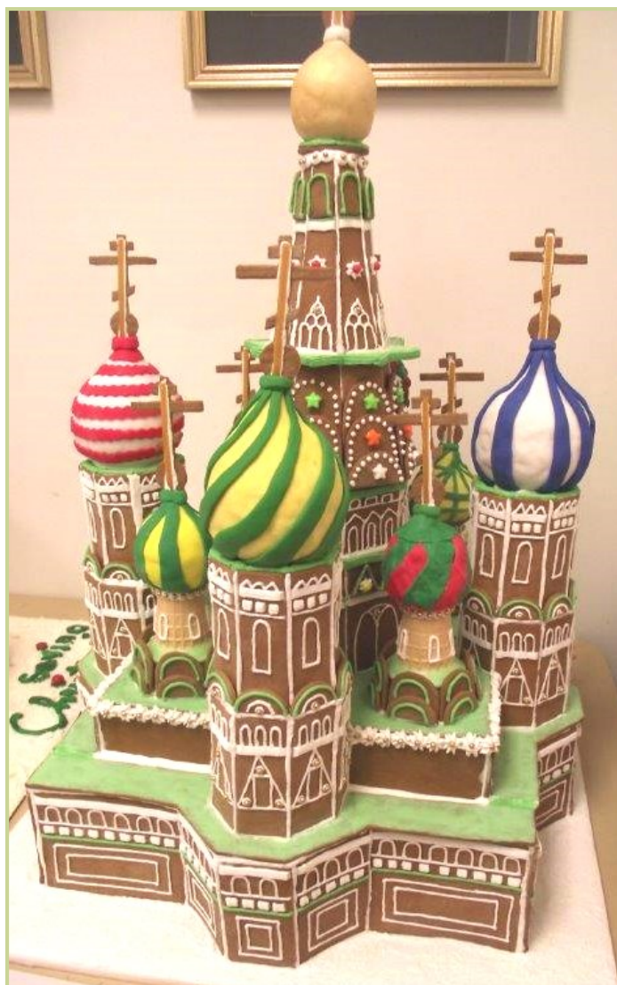
2014 Gingerbread Wonderland

Credit card usage increased through the year both on the website for membership, event registration as well as at the plant sale. The public can enjoy the convenience of online registration and payment by visiting our website.