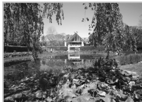
Peter's Pond / LongHouse Reserve

Escape to Long Island on an overnight South Fork Saunter on June 2 - 3, 2015.