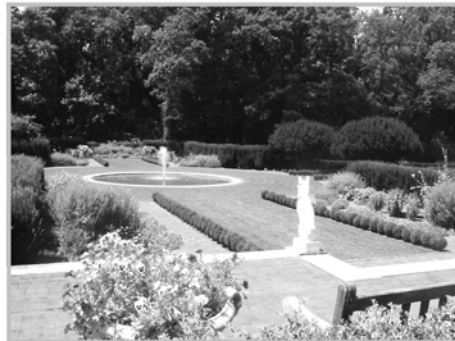
Nassau Museum Garden