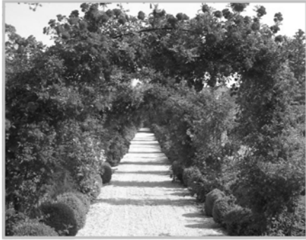
Rose Arbor / Madoo Conservancy

with The Friends of The Frelinghuysen Arboretum & Dig-It! 353 East Hanover Avenue • Morris Township, NJ 07962