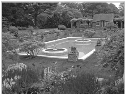
Italian Garden / Planting Fields