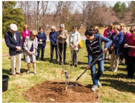
A family member lends a hand.