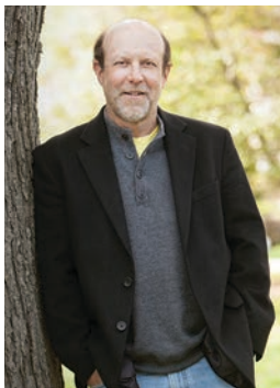
Larry Weaner

All too often in our gardens and landscapes we think of static compositions of carefully placed and managed plants. But our approach can be more dynamic – and arguably more rewarding – than that by taking advantage of plants' natural abilities to reproduce and proliferate. Learn how designer Larry Weaner combines design with the reproductive abilities of plants as well as ecological processes to