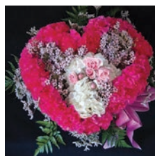
Photo of arrangement taken from above