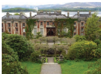
Bantry House, Ireland