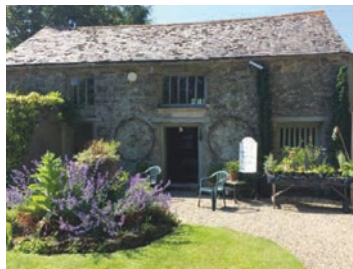
Cornwall and Devon