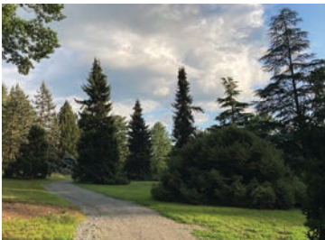
The Frelinghuysen Pinetum

The Friends look forward to working with the MCPC garden staff to develop tours showcasing the Arboretum's conifer collections, and to present educational programs on a variety of topics related to conifers. In fact, the upcoming Tree Symposium, scheduled for four consecutive Tuesday evenings in November, will be dedicated to the theme of conifers for today's gardens.