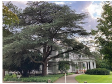
Atlas Cedar at the Mansion