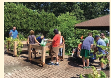
Activity in the Scherer Garden

The National Garden Bureau (NGB) launched a philanthropic program in 2014 that supports the building and growth of therapeutic gardens across North America. This program furthers NGB's mission of promoting gardening to gardeners and non-gardeners alike. The Frelinghuysen Arboretum has been named a finalist for this year's grant. First place will receive a $3000 grant and second and third places will each receive a $1000 grant. Finalists have been asked to create a video about their therapeutic garden and horticultural therapy programs. The video will be posted in early September for viewing and voting on a favorite garden.