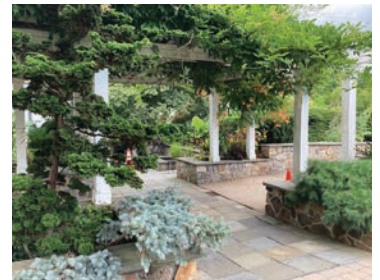
Conifers at the entrance to the HEC