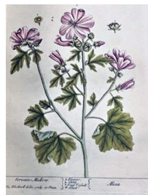
Botanical illustrations by Elizabeth Blackwell from The Elizabeth Donnell Kay Rare Book Collection. Top: Cucumber; Bottom: Alcea