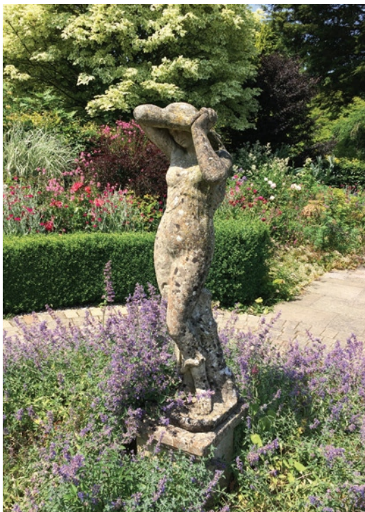
Burrow Farm Gardens