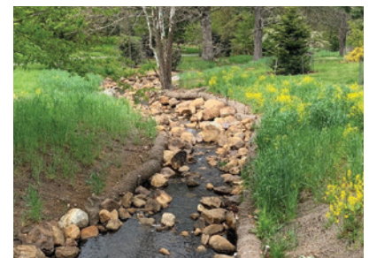
Streambank before and after restoration.