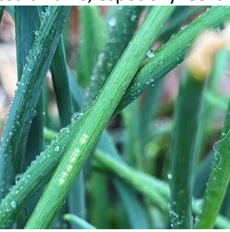
Linear feeding marks on chives. S. Brighouse, NJAES

Linear feeding marks from ALM adults on garlic leaf blade. M. Sample, NJAES