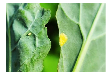
Left side kale leaf shows single Imported cabbageworm egg versus right side leaf with flat mass of Cross striped cabbageworm eggs.