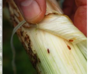
ALM adult Rutgers Plant and A Pest Advisory F