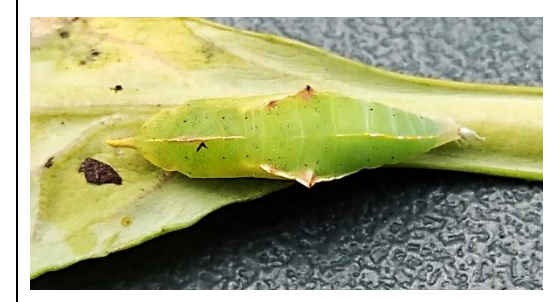
Pupae on underside of kale leaf.