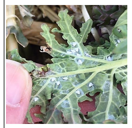
Whiteflies on the underside of a kale leaf.

These small piercing sap suckers damage foliage and plants quickly become overrun, due to adults and nymphs equally feeding on plant sap. Their feeding then leaves honeydew behind, with sooty mold fungus to follow. With favored host plants available thoughout winter, in addition to rapid reproduction, an infestation will survive and linger if not controlled swiftly.