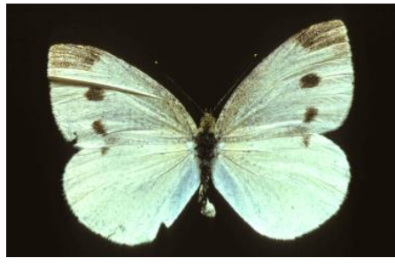
Adult female Imported Cabbageworm butterfly with black tips and two dots on center forewings.