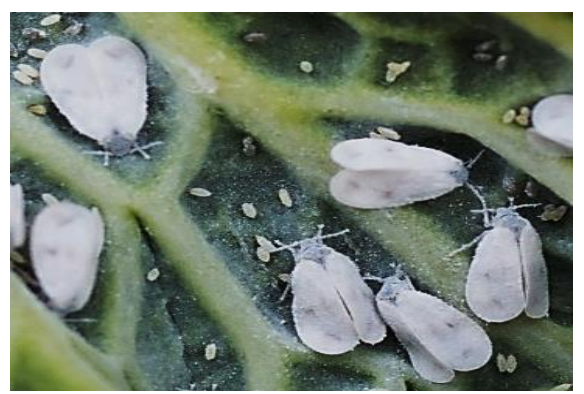
Cabbage whiteflies close up showing their distinguishing grey spots. The small white ovals are other stages of the whitefly lifecycle. P. Nitszche, NJAES