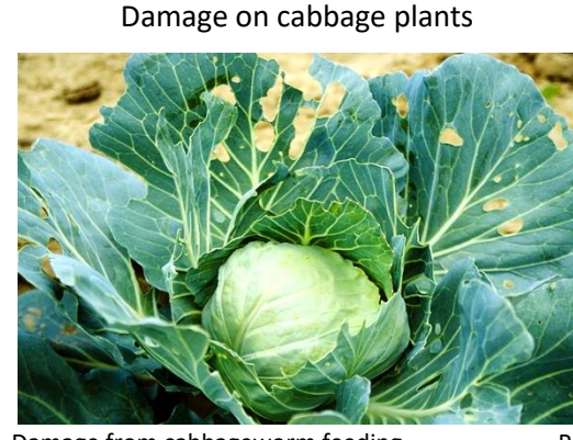
Damage from cabbageworm feeding. Nitzsche NJAES