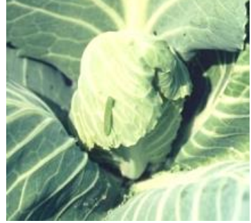
Larvae on cabbage.