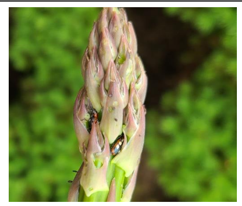
Asparagus beetles can be found feeding within spears, disfiguring and destroying crop. Fast removal of eggs will help prevent damage and additional generations.