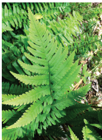
Goldie's Wood Fern, photo courtesy of Jean Epiphan